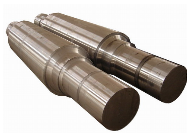
Steel - Roller