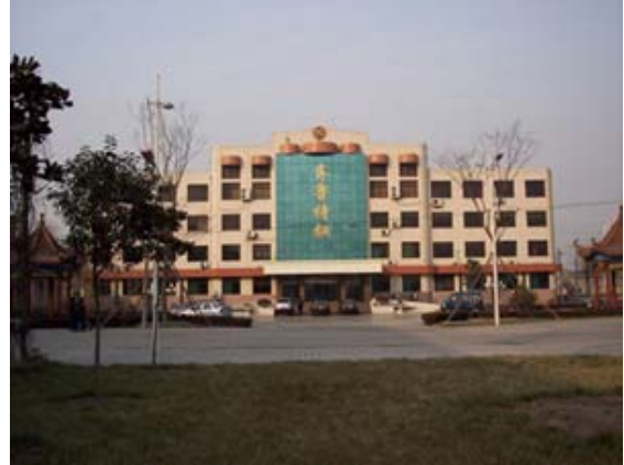
The office building