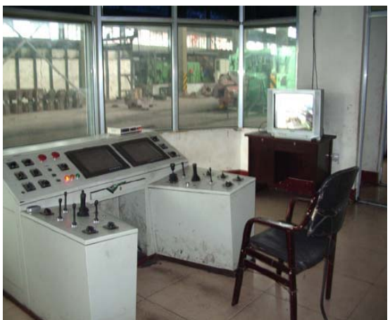
16MN operating room