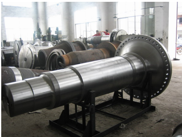
Shaft – of – Wind – Power – Generator