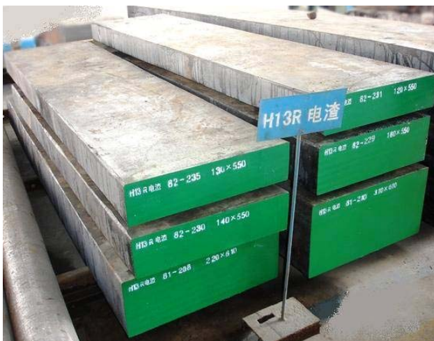
Die – Steel – Bar