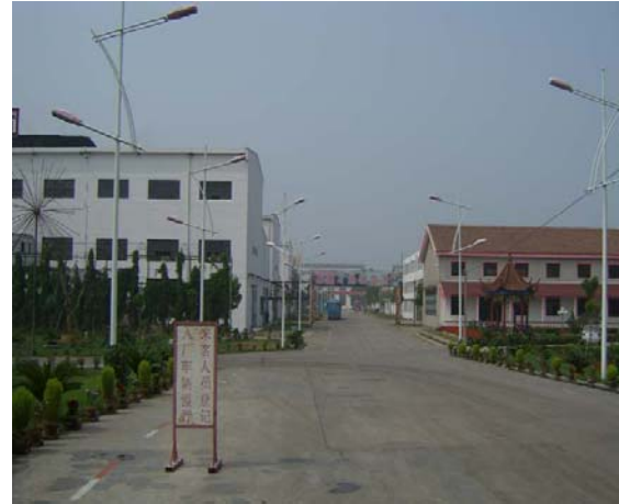
The workshop building