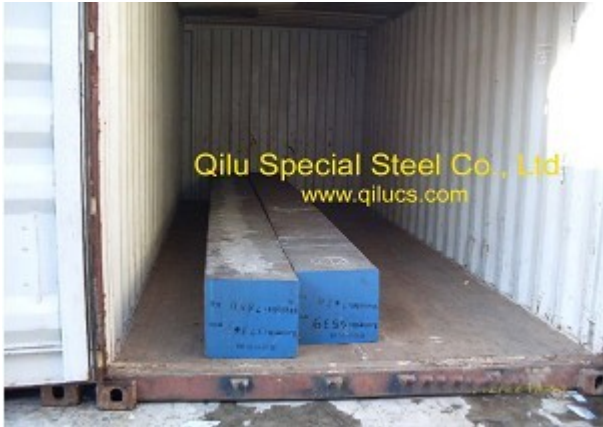
Alloy – Tool – Steel – Bar – DIN -1-2713