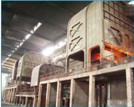
UPH EAF Furnace