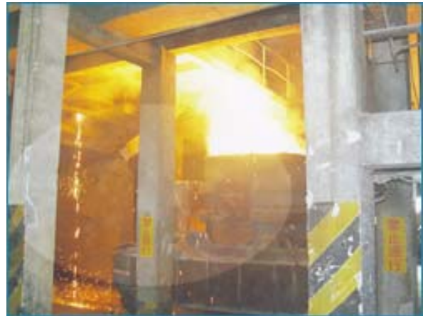
LF Fining Furnace