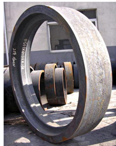
Forged - Ring