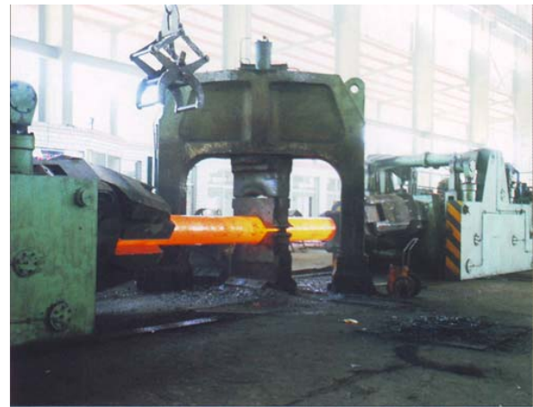
16MN fast forging machine