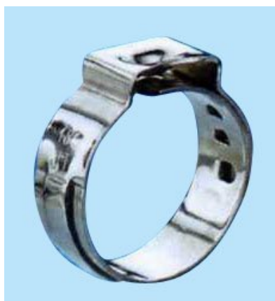
2 Photo Etching