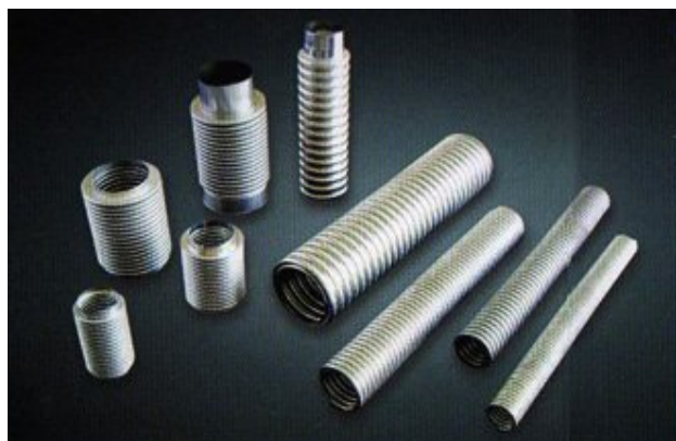
1 Photo Etching